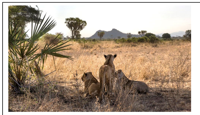
Wildlife Services. He gave us descriptions of his

He described his home village as it was when he was a child. It was an agricultural village on the edge of the forest. Wildlife was abundant, and villagers grazed their cattle in the forest. By 2005 the natural resources of his home village were greatly diminished. There was less farming, fewer wild animals, and even a paucity of the native grasses that are used to thatch roofs.