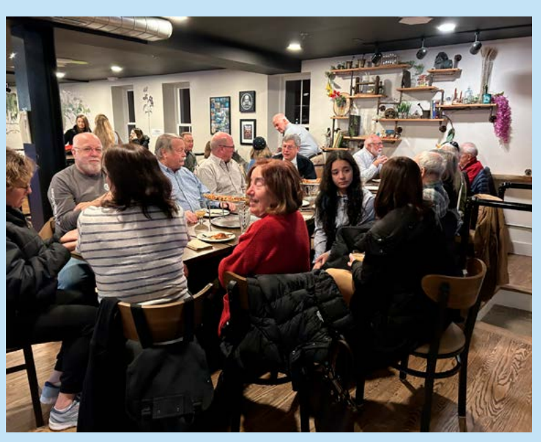
Tox Brewing hosted our latest Rotary After hours on January 2nd. It's a great space and offers a great selection of craft brews.

We sampled a variety of pizzas and craft brews. All were delicious!!