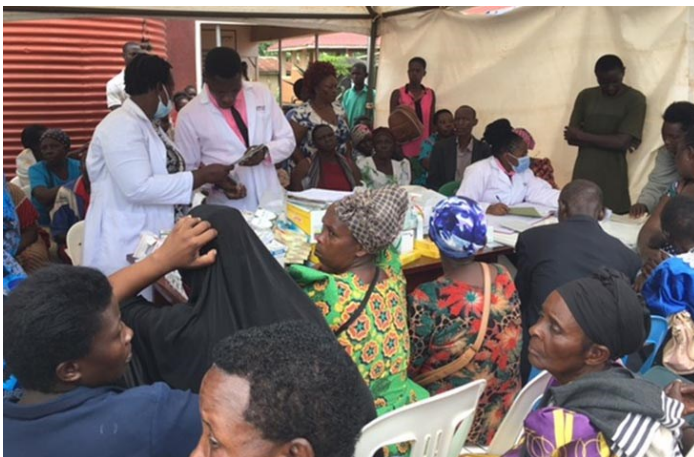
Triage area where arrivals are screened and assigned to stations to meet their needs.

The latest Global Grant occurred in the summer and fall of 2023 when 110 Ugandan Rotary Clubs and 20 Rotaract Clubs conducted 163 health camps, serving more than 41,000 people throughout Uganda.