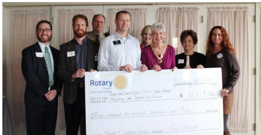
Caption: Cincinnati Eastside Rotary presents a check totaling more than $11,000 through proceeds from the Charity 4-Children Gala to support youth initiatives in the local community.