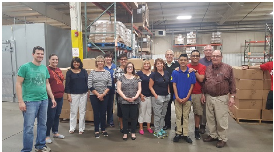
The Springfield Rotary Club, local projects committee is partnering with the Second