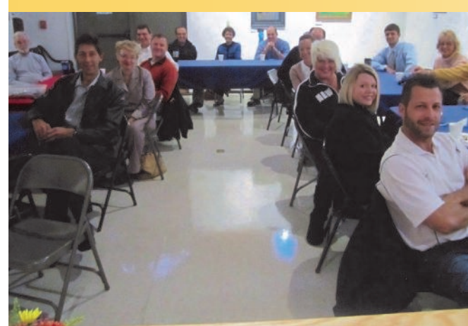
The club meets at the Yoctangee Park Pump House, which is an art gallery where the artwork changes regularly.