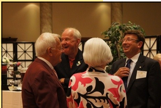
Having Fun and Meeting Friends