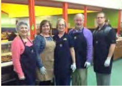
Zanesville Daybreak Rotary serving lunch at Christ's Table.