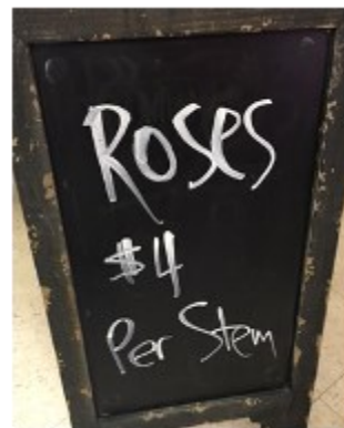
An add-on—very successful.