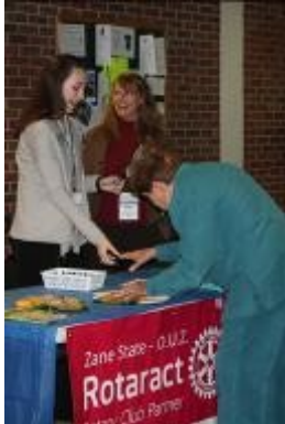
OUZ-Zane State Interact Purple Pinkies drive

Please extend my thanks to all your club members that made donations.