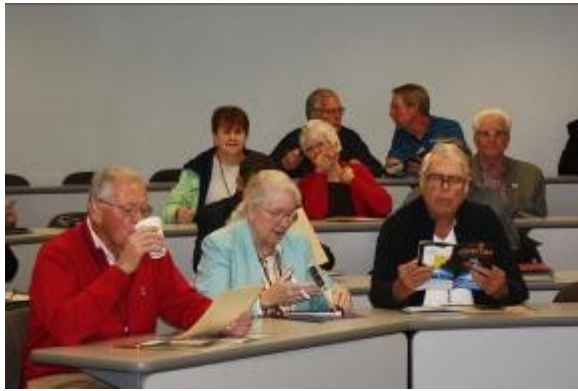
Grant Writing Seminar