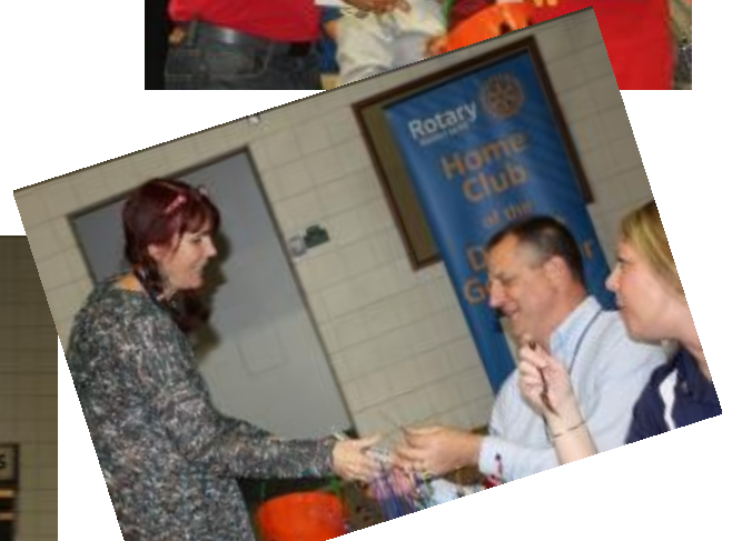
Raising funds for Polio Plus