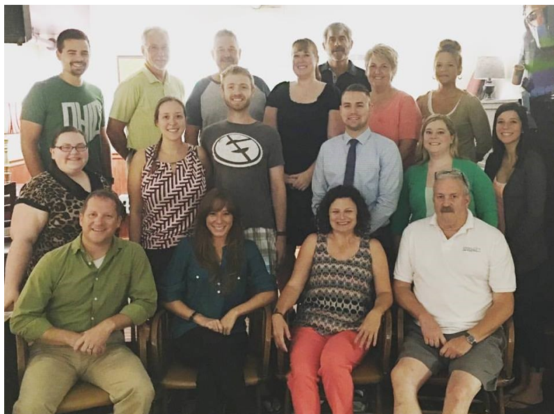
Athens Sunrise held their first official meeting August 4, 2016