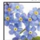
Forget Me Not

Cut off seeded bookmark end and place in good soil. Add water. Biodegradable glue and paper will dissolve. Add sunlight and keep soil moist until seedlings are well established.