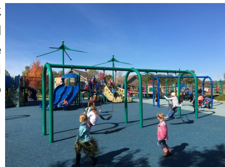
The Newark Rotary Accessible Playground following a surface restoration this fall.

than 99 percent of the 35,247 Rotary Clubs in the world today have been formed since. The club has grown from 56 charter members to its current membership total of 227 making it the second largest Rotary Club in Rotary District 6690.