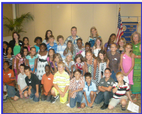
Fourth Grade Students Sigsbee Charter School