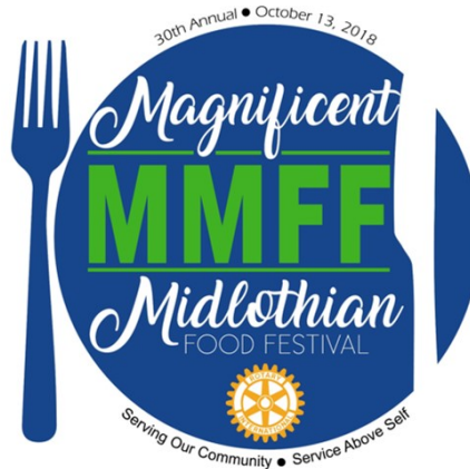
Great New Logo for MMFF!