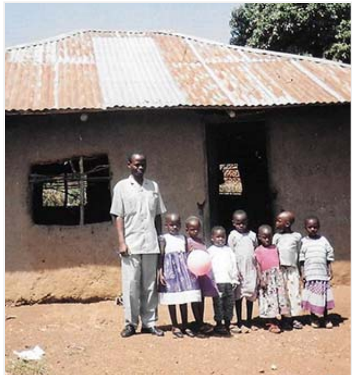
Bondo Primary School teacher and students.