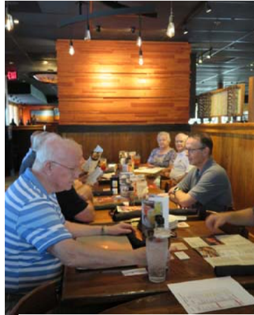
Thanks to Membership for picking an Outback lunch for the 5th Wednesday. It was great fellowship.