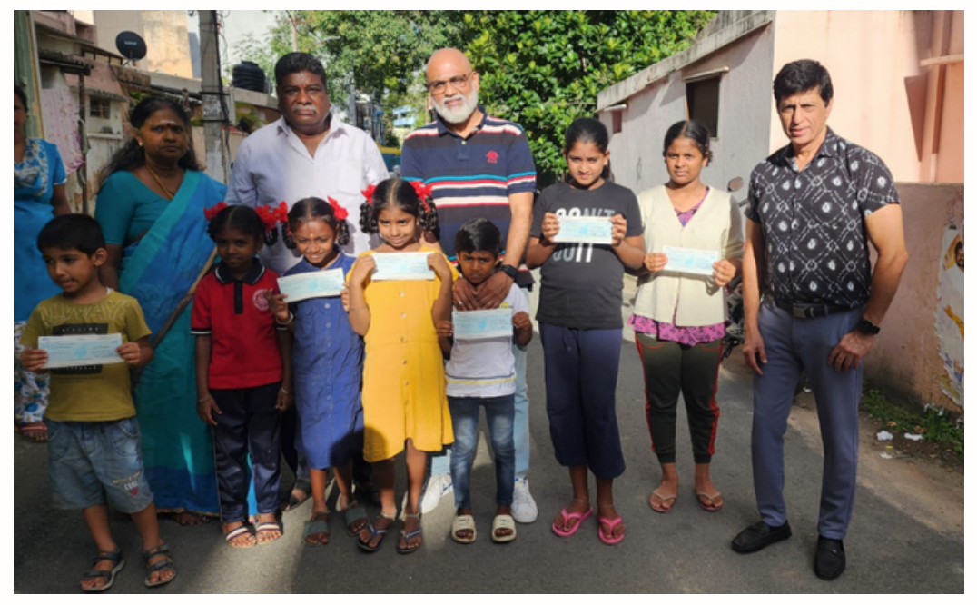
Free Distribution of Sidda Medicines: A Joint Initiative

We presented the cheques to the respective beneficiaries and their parents of the Vishvamanar Educational Scholarship.