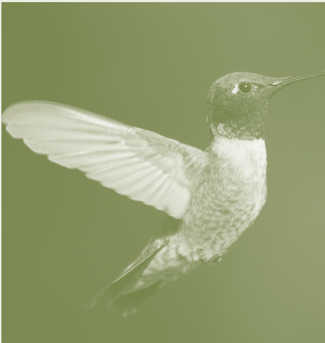
Black-chinned Hummingbird, a summer species in the Thompson-Okanagan Plateau ecoregion.