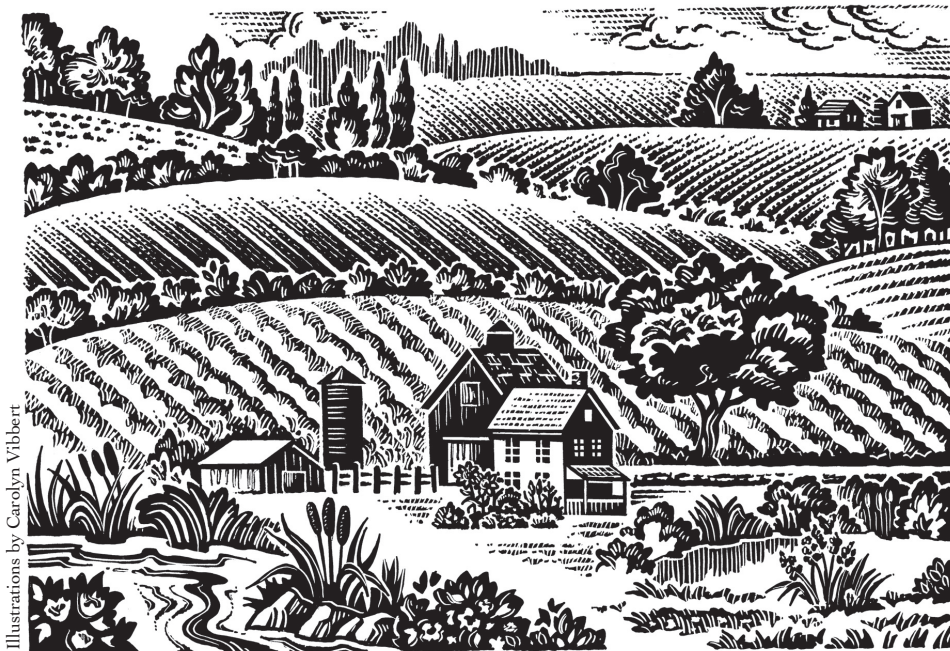
Illustrations by Carolyn Vibbert

• Check with local not-for-profit organizations, or government agencies to see what technical support might be available to assist you in your effort to provide nectar, pollen, and larval food sources for pollinators on your farm.