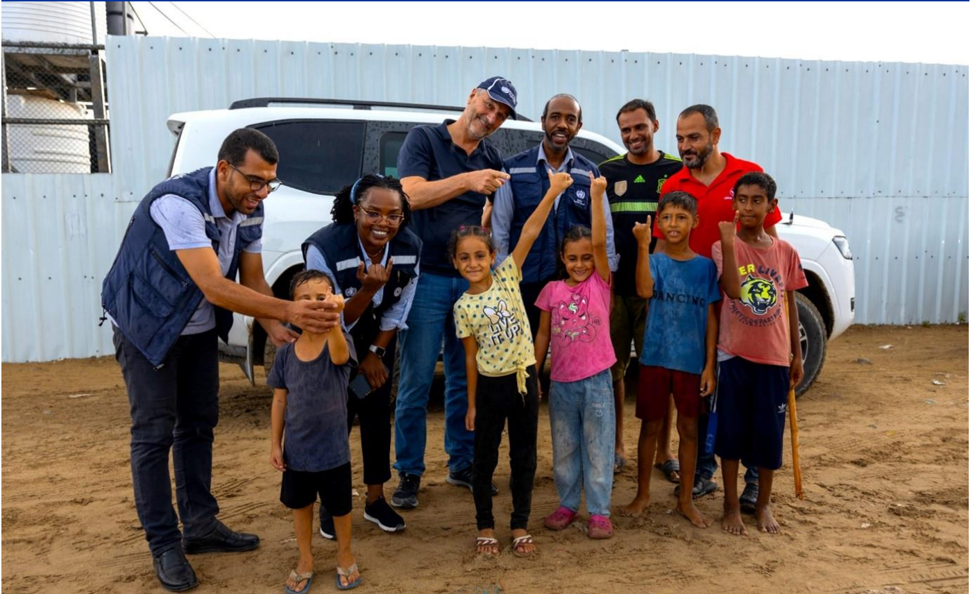
Children in Gaza hold up their pinkies after being vaccinated against polio.