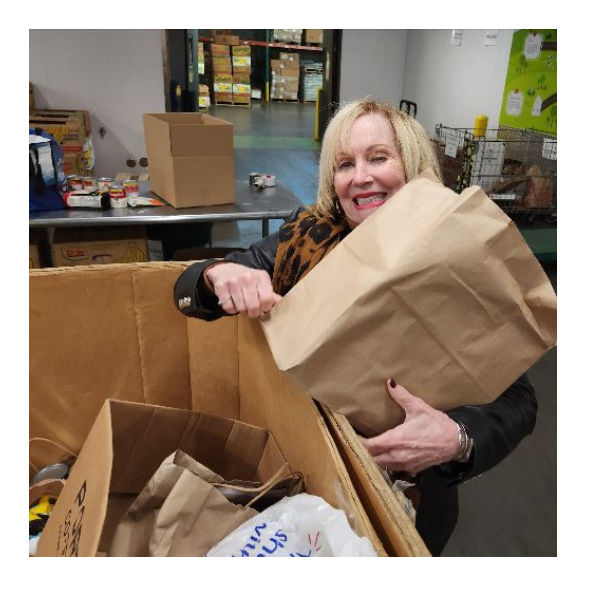
The Rotary gang at Winco shopping for 18 families in the Camas Washougal area for Thanksgiving. This annual project is partially