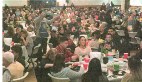
Shrimp Dinner 4 th Saturday in February