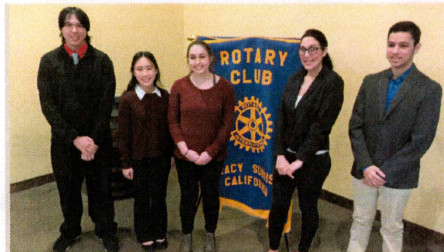
Scholarships/ Youth Programs