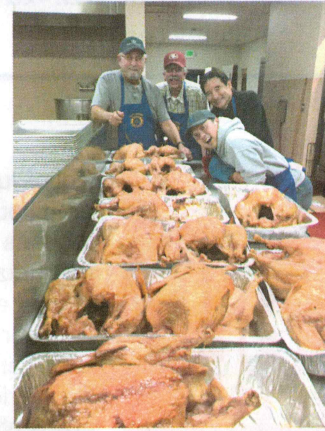
Senior Thanksgiving Dinner