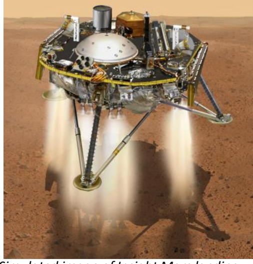
Simulated image of Insight Mars landing