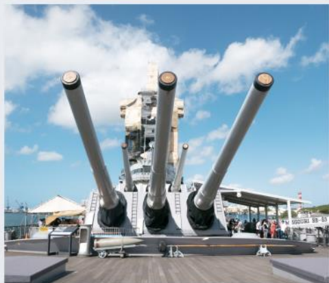
USS Missouri, Pearl Harbor