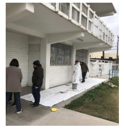
Time to paint and time to be fancy.