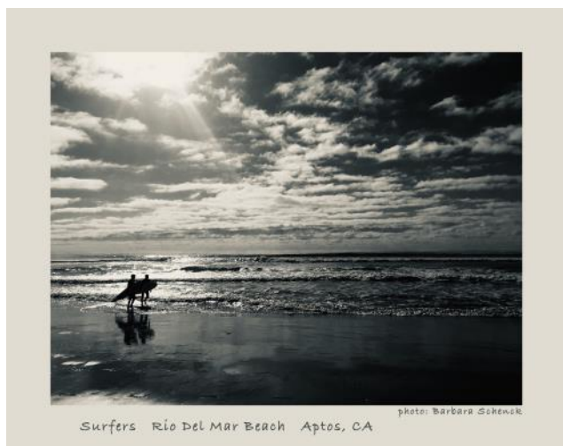
Surfers Rio Del Mar Beach Aptos, CA