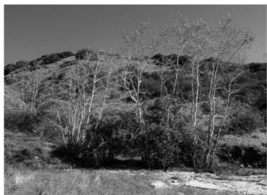
Claremont Wilderness Park 2-23-2019