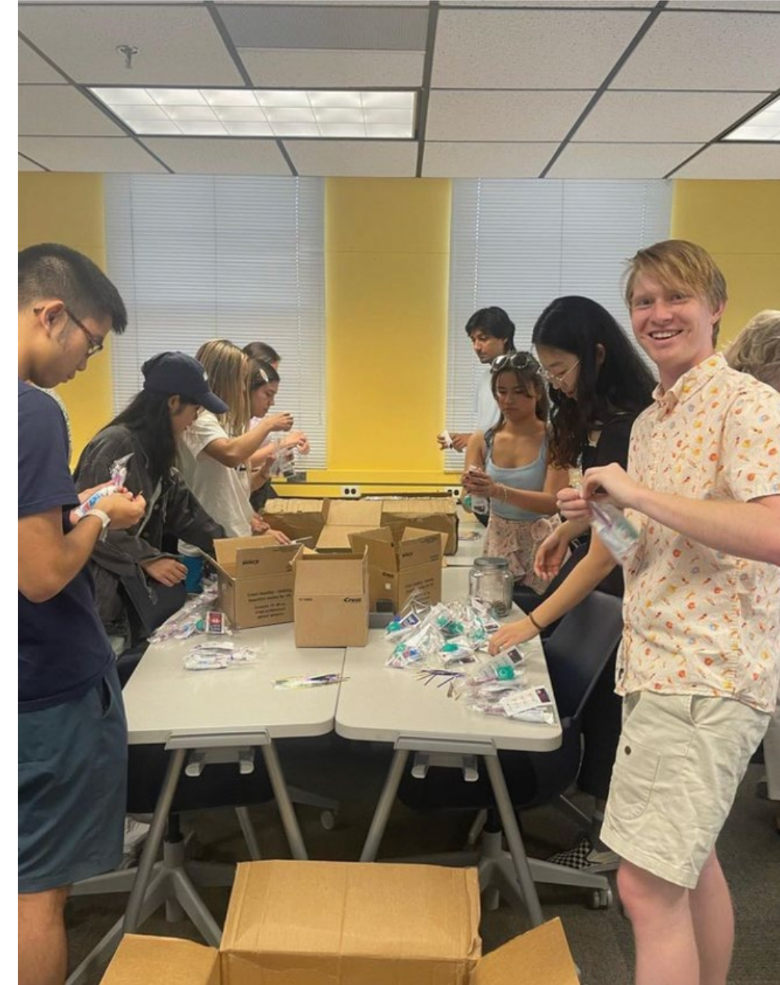
Spring 2023- packaging and distributing dental bags