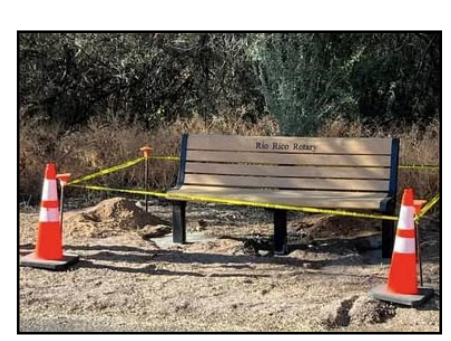
RIO RICO Built and installed 3 new benches on a Rio Rico nature trail.