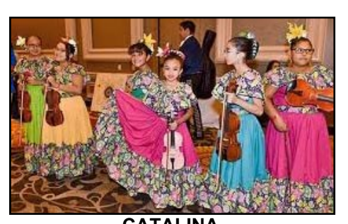
CATALINA Support & publishing workbooks for the Tucson Mariachi Conference.