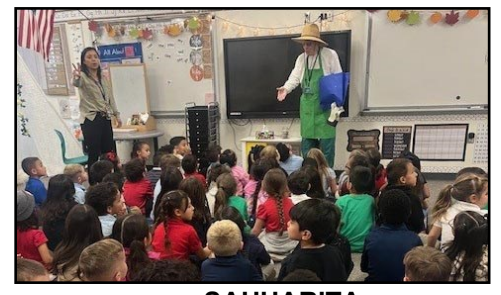
SAHUARITA 500 nature books & totes were distributed to kindergartners.