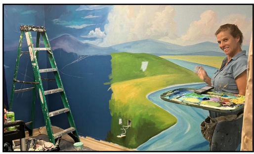
YUMA Yuma club built a sensory room for kids with sensory challenges.