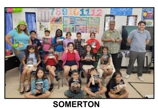
9 Rotary clubs in Yuma joined in the Dictionary Project for 3,000 3rd graders.