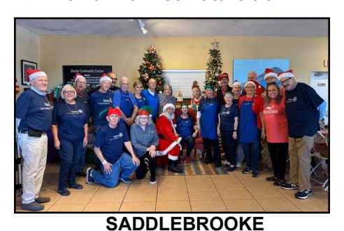
36 Rotarians help put on a Holiday Luncheon for 140 low income seniors.