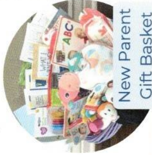
New Parent Gift Basket

Please reach out to our New Parent Coordinator at 479-282-3639 newparent@dscnwa.com