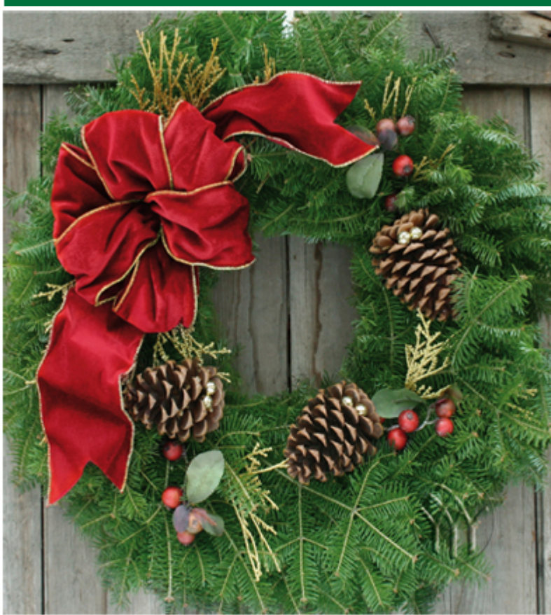
Cranberry Splash Wreath $40.00 This traditionally festive wreath is made from natural Balsam Fir boughs and is decorated with a generous, 4" wide, fabric bow with gold wired edges. The ornamental trimmings include faux Cranberry sprigs and gold Juniper twigs. Three naturally bronzed Ponderosa Pine cones laced with gold jingle bells set the finishing touches for this stunning addition to your Holiday Decor.