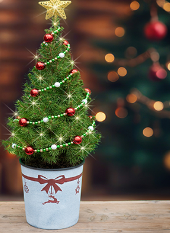
Starlight TableTop Tree $42.00

This adorable live Christmas Tree comes with a whimsical garland as pictured and a tree-top LED lit Star and Light Set which add to the whimsical Holiday charm of this iconic Christmas Tree. All trimming arrives with the tree for fun, easy decorating. Each tree comes complete with care instructions.