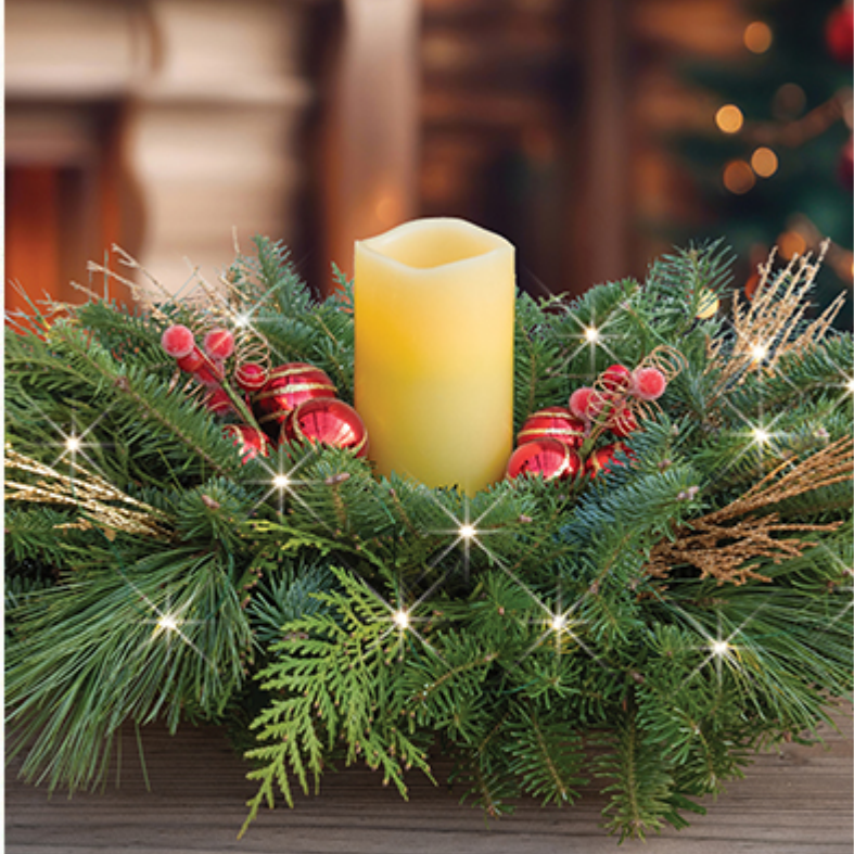
The Sugarberry Centerpiece $40.00

This adorable live Christmas Tree comes with a whimsical garland as pictured and a tree-top LED lit Star and Light Set which add to the whimsical Holiday charm of this iconic Christmas Tree. All trimming arrives with the tree for fun, easy decorating. Each tree comes complete with care instructions.