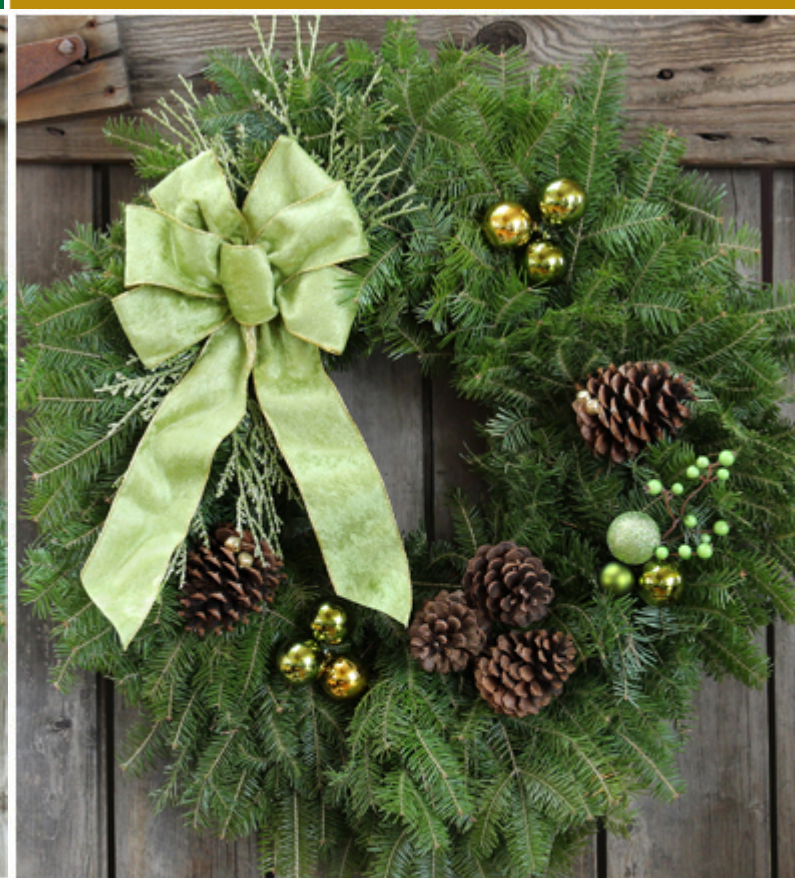
Wintergreen Wreath $40.00 The Balsam Firm Wintergreen Christmas Wreath combines a selection of interesting Christmas elements to create a truly memorable Holiday decoration. The soft, green fabric bow is made with wired ribbon to hold the full arc of the bow's loops and tails. Behind the bow is a swag of glittered faux cedar which adds just a hint of shimmer to the wreath.