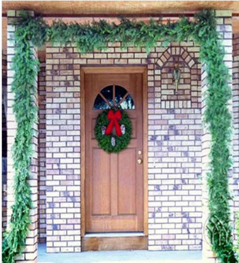
25' Balsam Fir Garland $50.00

This garland adds the perfect holiday touch to entryways, deck railings, and a host of other outdoor home applications.