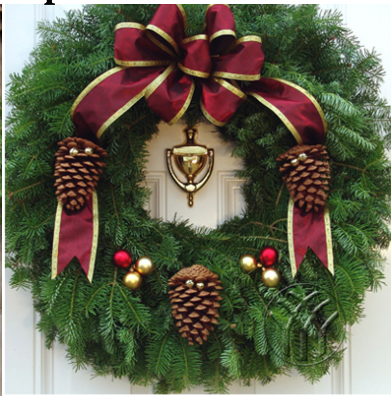
Victorian Wreath $40.00 The Victorian Wreath offers a taste of the Old World craftsmanship to your Holiday Decor. Handcrafted from Minnesota Balsam Fir, the Victorian is trimmed with an exquisite burgundy bow with imprinted wired edges. Natural bronze pine cones accented with gold jingle bells and unbreakable satin finished Christmas Bulb Ornaments complete this enchanting wreath.