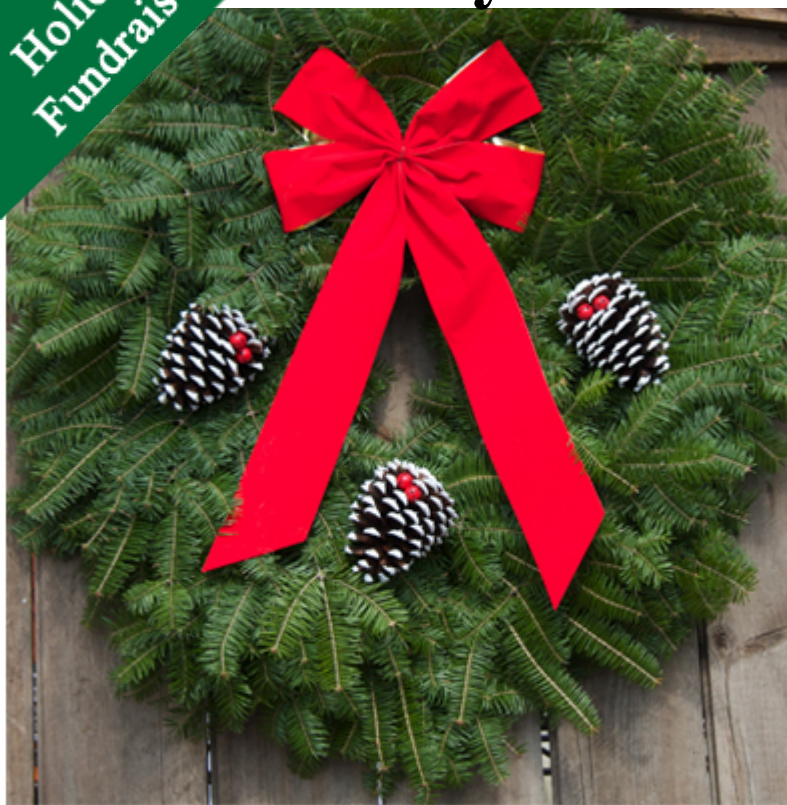
Classic Wreath $34.00 The Classic Wreath is as traditional as Christmas itself - handcrafted with the freshest Minnesota Balsam Fir. This Wreath is beautifully decorated with selected, white tipped cones, festively accented with jingle bells and trimmed with a gold-backed red velveteen bow. Celebrate the holiday season with this traditional symbol of world peace.