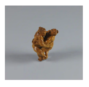
<u>Powerful Forces: Legends, Rituals, and Warriors in East Asian Art</u>

The exhibit is free and open to the public during regular gallery hours, which are 8 a.m. to 5 p.m. Mondays, Tuesdays, Wednesdays and Fridays and 8 a.m. to 7 p.m. Thursdays.