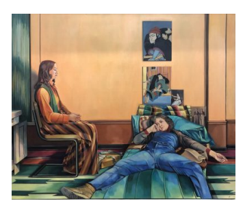
Legendary Voices: Art for the Next Century

September 7, 2024 - February 16, 2025 at 11:00 am