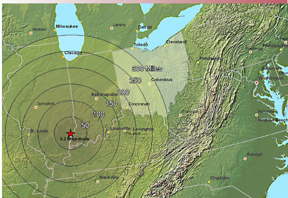
April 18, 2008 Recorded IL Earthquake