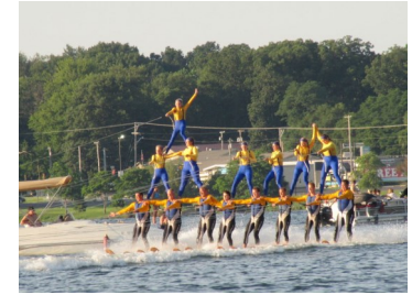
2018 Project: Hub of Awesome Water Ski Show