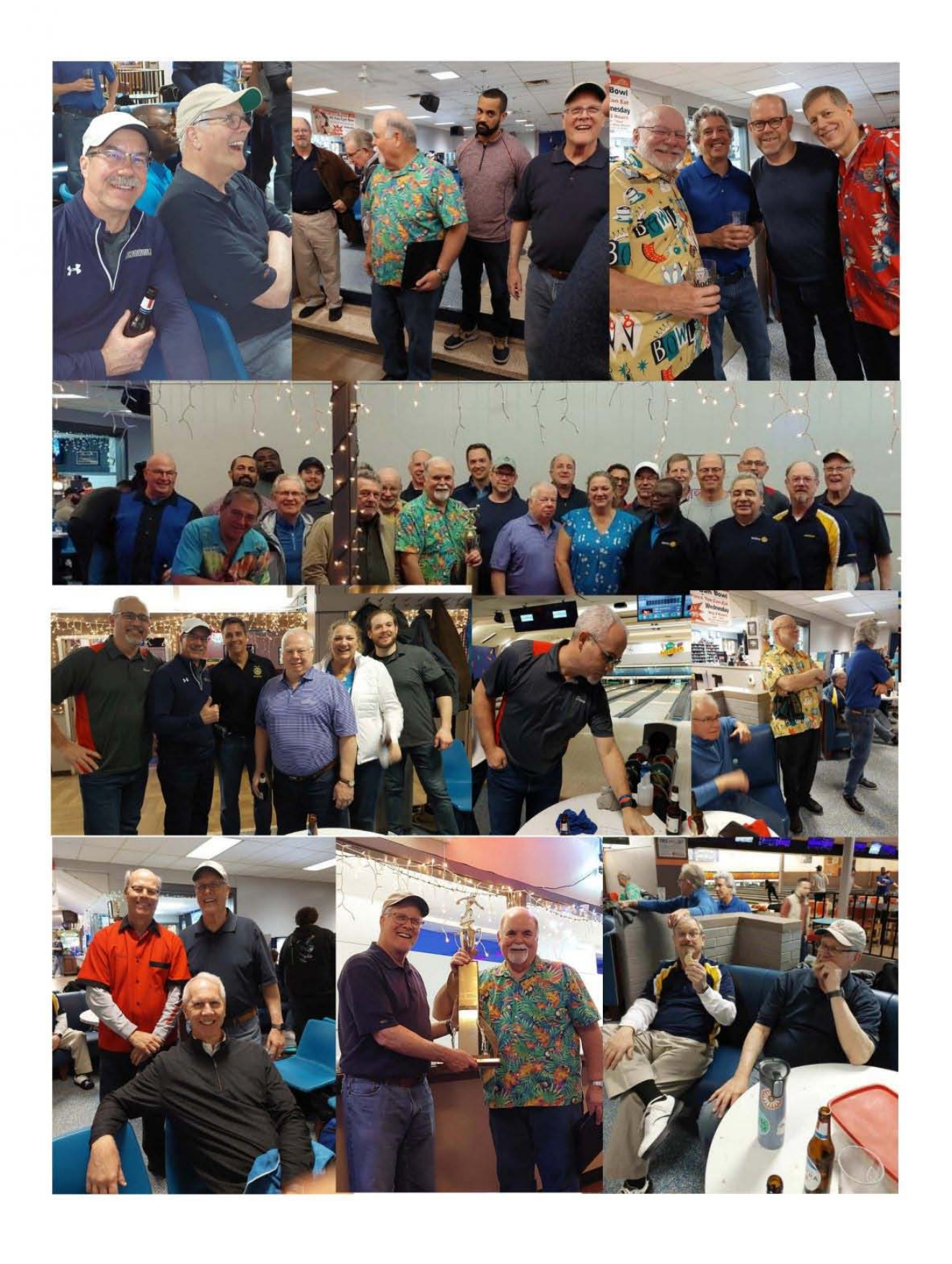
Red Ribbon Takeover to Support The Victory Project