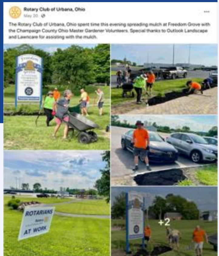
A recent post on the Facebook page of the Rotary Club of Urbana, Ohio about the work done at Freedom Grove.

Club members are encouraged to “like” and “share” club posts as a way to highlight and market the club’s activities.