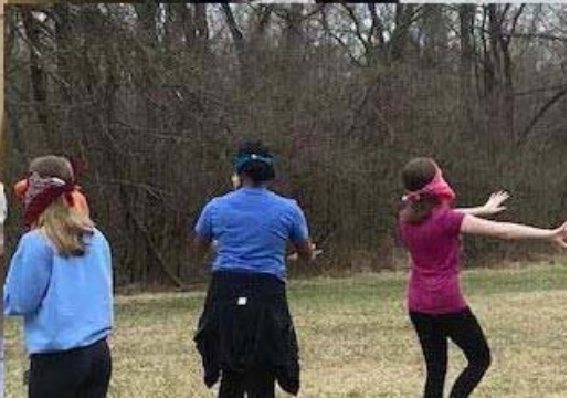
District Golf Outing