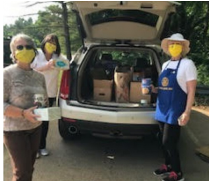
Athens Rotary holds a food & personal-care items drive.

Way to go, Rotarians! Keep up the good work!