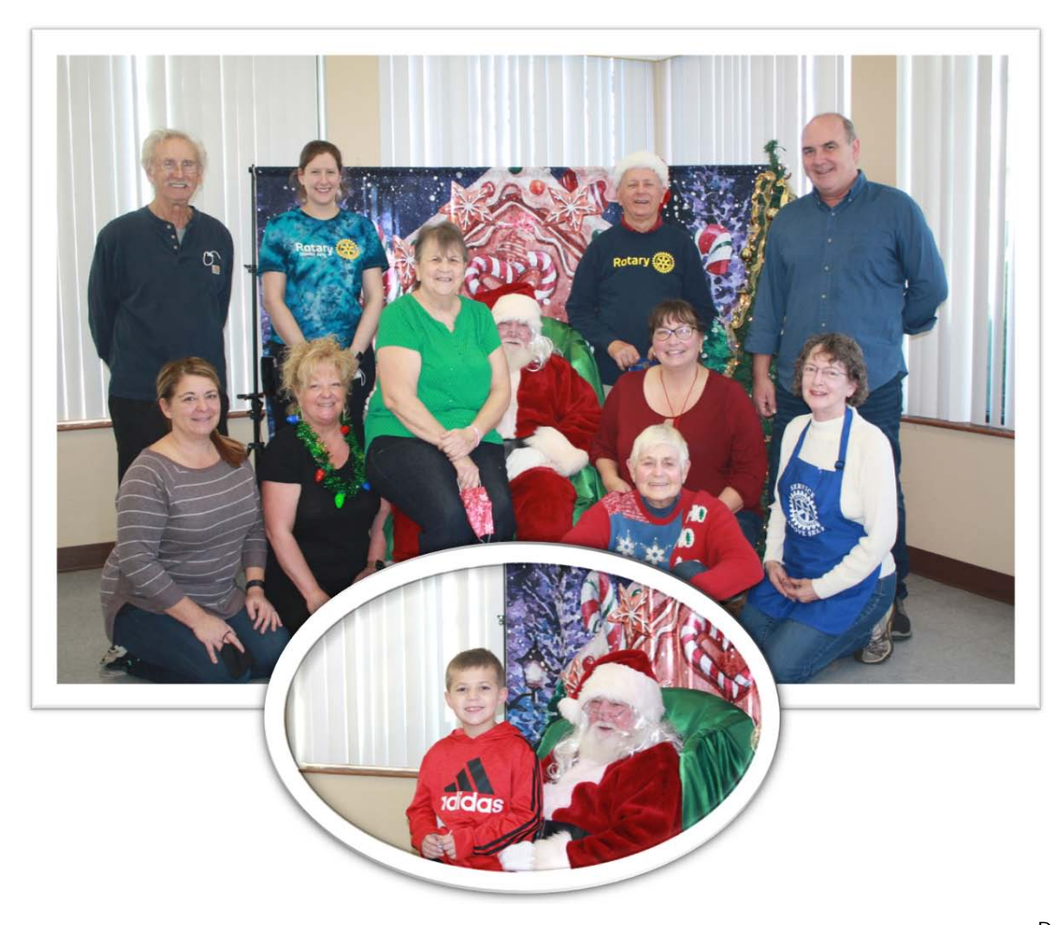
Dec, 4, 2021 Byesville Rotary hosted a Preakfast with Santa pancake breakfast on Sat, Dec. Club members served pancakes, eggs, sausage, juice and milk or coffee breakfast for $5.00 for everyone over 5. Breakfast included a visit and picture with Santa. Over 90 parents and kids were happy to see Santa again.