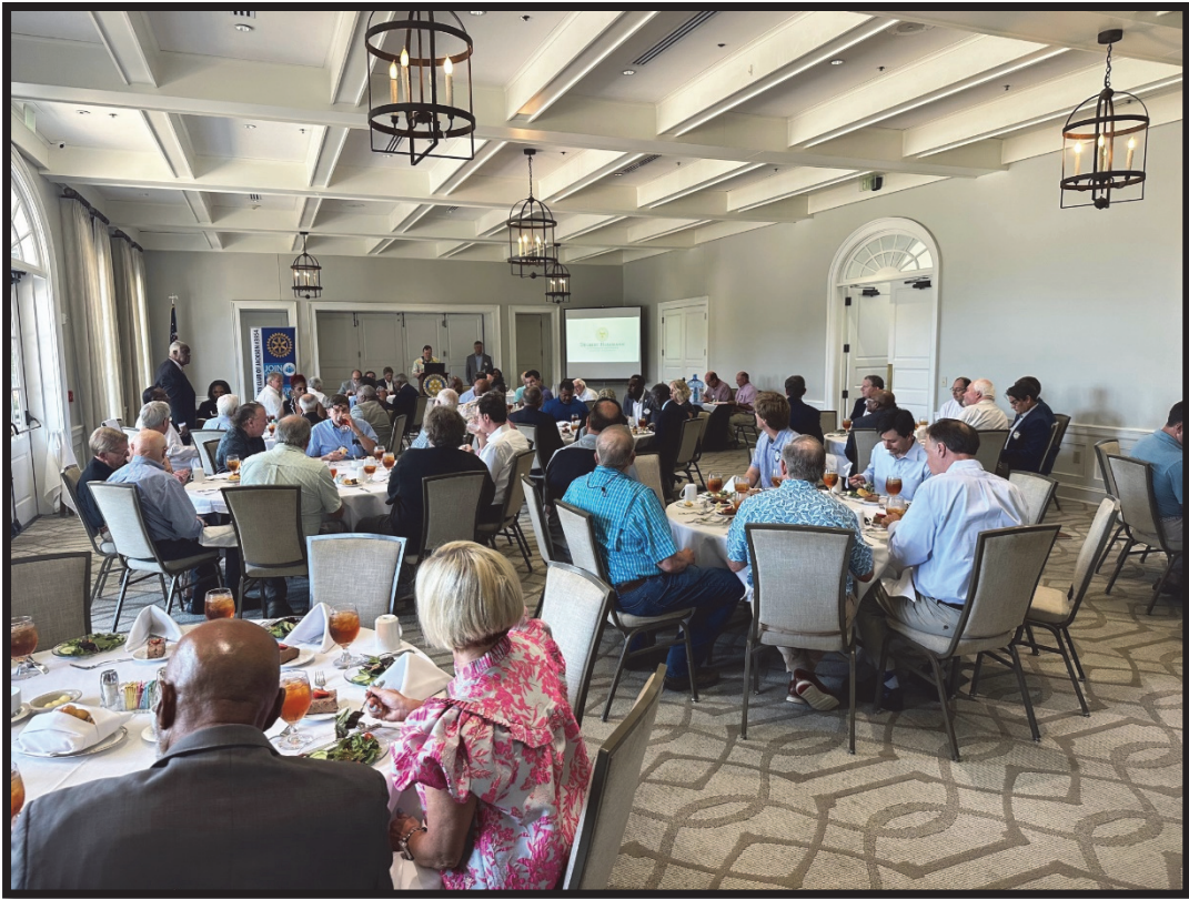
A full house at Rotary.