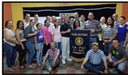
The Rotary Club of La Paz, Honduras formed as a result of our work in 2016 and 2018 (photo 2019)

In 2016, we coordinated $12,500 in cash and DDF to provide 100 bio-sand water filters to impoverished residents in and around the mountains of Comayagua. Seeing the tremendous need for clean water, sanitation and hygiene, we then led a recently-completed $38,500 Rotary Foundation Global Grant to install over 110 engineered latrines in the same communities. Working with the Rotary Clubs of Lake Wales Breakfast and Sebring, we have just submitted a new Global Grant application to bring Chispa Project children's libraries to 12 elementary schools throughout various parts of Honduras.