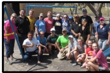
Rotarians in front of newly installed school playground equipment in Comayagua (2019)

In 2016, we coordinated $12,500 in cash and DDF to provide 100 bio-sand water filters to impoverished residents in and around the mountains of Comayagua. Seeing the tremendous need for clean water, sanitation and hygiene, we then led a recently-completed $38,500 Rotary Foundation Global Grant to install over 110 engineered latrines in the same communities. Working with the Rotary Clubs of Lake Wales Breakfast and Sebring, we have just submitted a new Global Grant application to bring Chispa Project children's libraries to 12 elementary schools throughout various parts of Honduras.