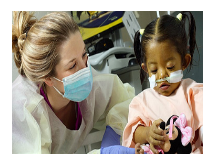
Donate Donate to purchase a Scentsy Buddy for a Child in the Sedation Unit

In partnership with Golisano Children's Hospital in Fort Myers, our <u>District E-Club</u> has created the "Scentsy Buddy Project". The goal of the Project is to provide Scentsy Buddies for the comfort of children in the Pediatric Sedation Unit