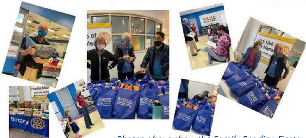
Photos above show the Family Reading Fiesta co-hosted by the Rotary Club of Bonita Naples and YMCA of Bonita Springs.

Do you know how many of the District Designated Fund (DDF) grants this year focused on increasing literacy? Keep reading. In District 6960, we have literacy programs that support reading in K-12 public schools, charter schools, YMCAs, preschool programs and literacy councils. We have programs for moms and tots, financial literacy, dictionaries, water safety and healthy living choices. This year's District Designated Grants can be found on DACdb and include the 15 grants directly related to literacy.