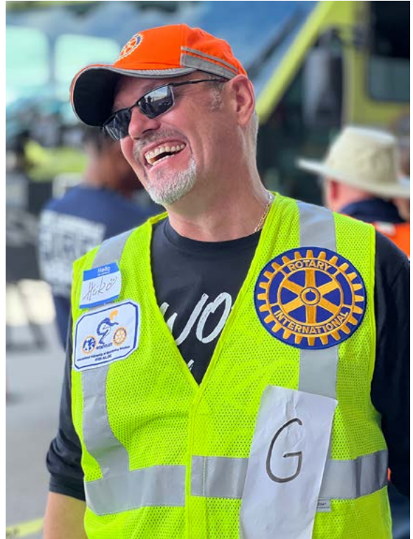
People of Action

The Fort Lauderdale Rotary 1090 Foundation is the non-profit organization of the Rotary Club of Fort Lauderdale under Section 501(c)(3) of the Internal Revenue Code, Employer Identification Number (EIN) 23-7247846.