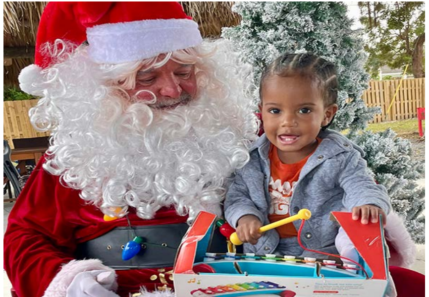
Holiday Toy Drive