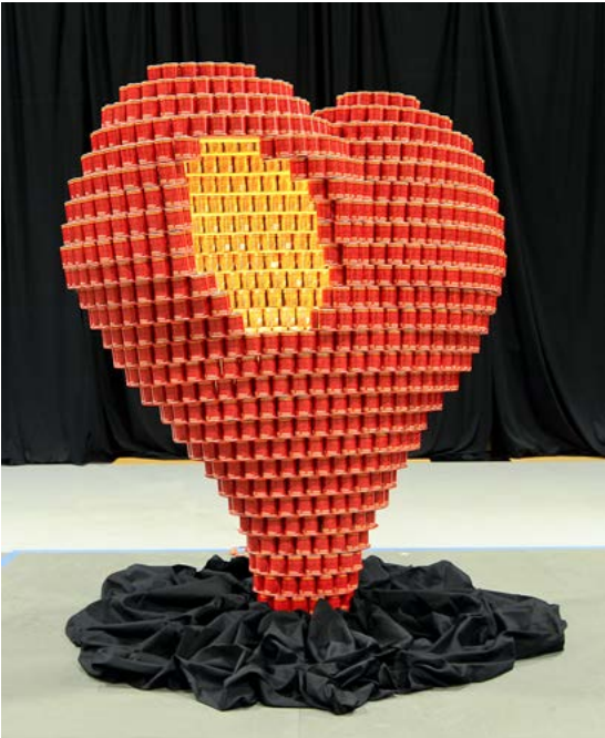
Heart Canstruction Sculpture

The heart of this event is community partners designing and building artistic sculptures out of canned goods and non-perishable food items with awards going to the best design by category.