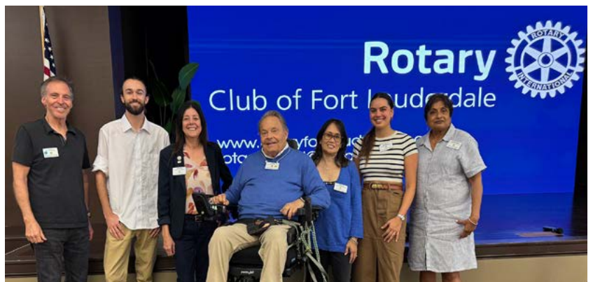
Together We Inspire