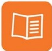
Basic Education and Literacy