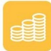
Economic and Community Development