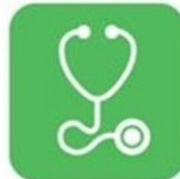
Disease prevention and treatment