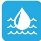
Water and Sanitation