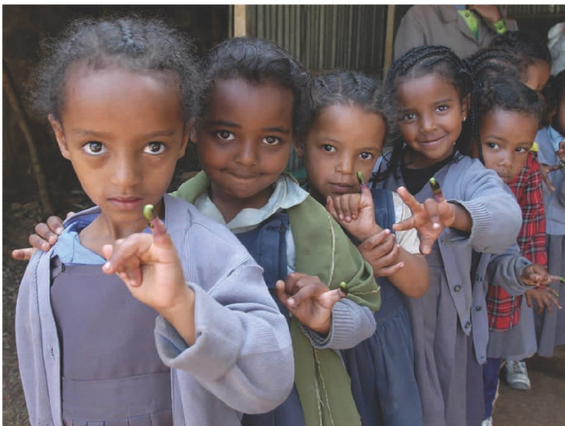
Delivering on a Promise

This is what happened. The World Health Organization decided right from the first detection of these cases that Mozambique and Malawi and the continent of Africa would still be certified as free of the wild polio virus. Furthermore, WHO decided that the United States and the continent of