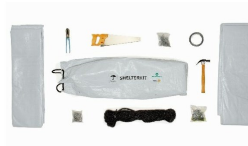
Shelter Repair Kit