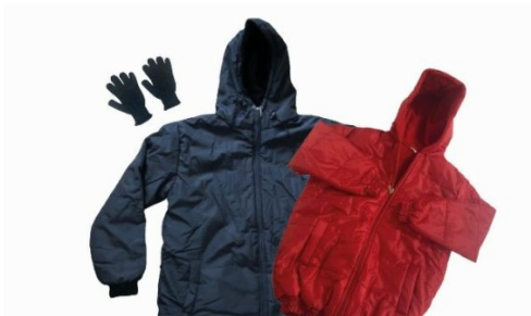
Winter Clothing Bundle