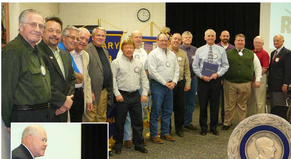
Fifteen of our members receiving PHF awards came up for a photo on 12/17.