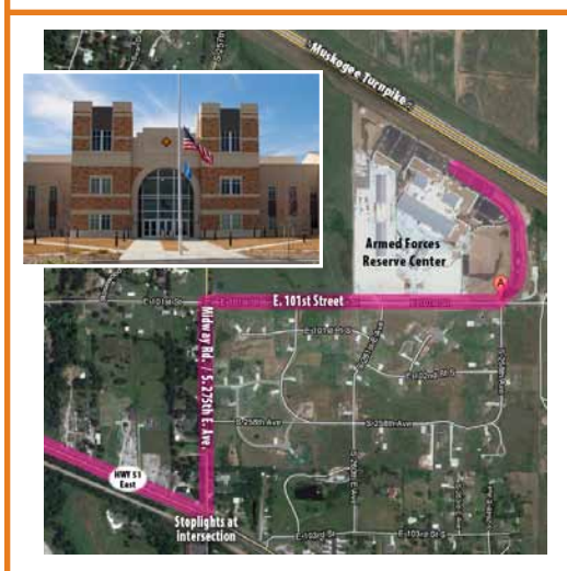
Armed Forces Reserve Center map. More about the center will be in the next issue of the Broken Record.