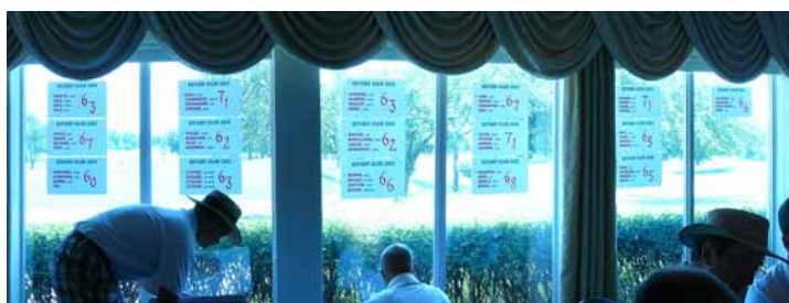
Team scores are posted on the Glass Verandah windows.