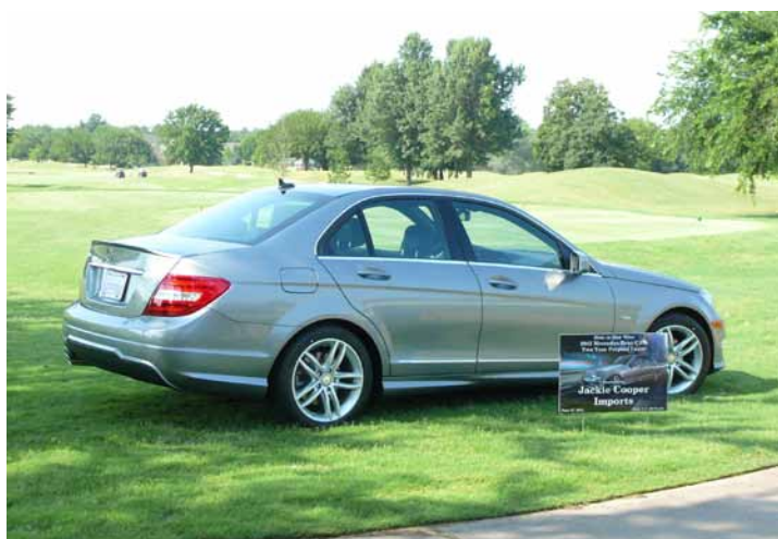
Players tried their best to win the Mercedes from Jackie Cooper Imports, but no holes-in-one made this time.