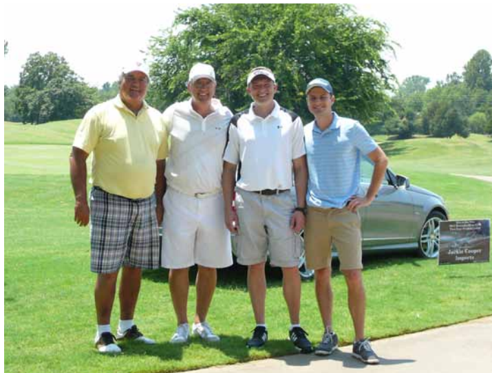
Tournament winners were the Arvest Bank team. They posted a score of 60 and said they really enjoyed the event.