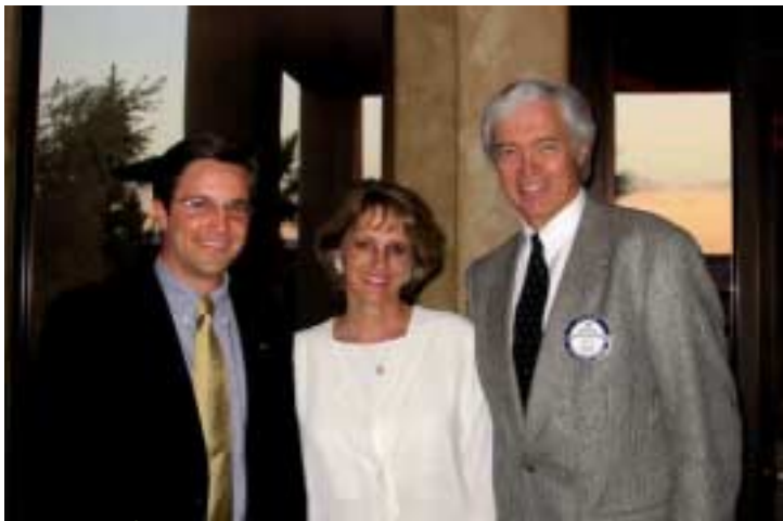
The 10 th anniversary party of the Green Valley Rotary Club.